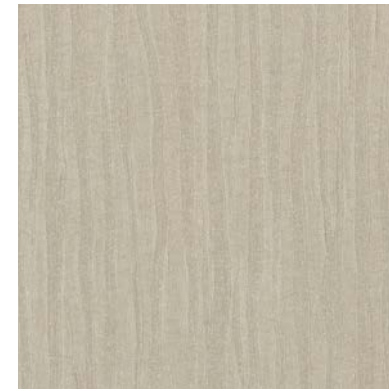
Click for CD2-GAZ-12