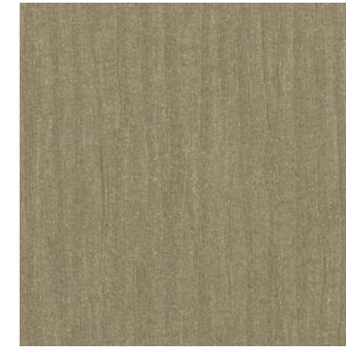
Click for CD2-GAZ-05