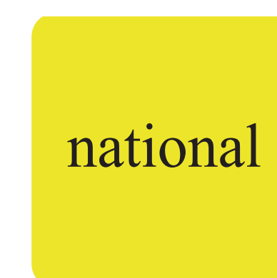
Click for all Solutions