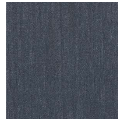
Click for CD2-GAZ-09