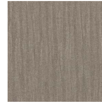
Click for CD2-GAZ-06