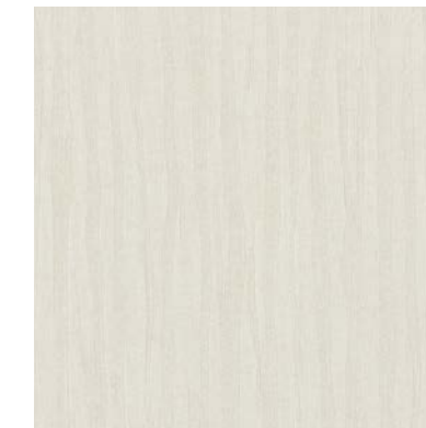
Click for CD2-GAZ-10