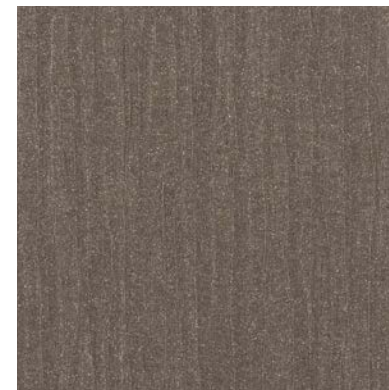
Click for CD2-GAZ-16