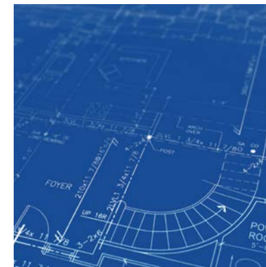
Click for Full Product Specs