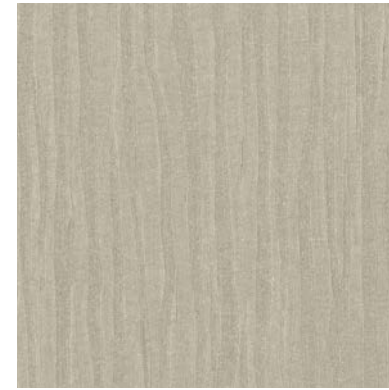
Click for CD2-GAZ-04

» CLICK FOR: » QUOTES » STOCK CHECK » SOURCEBOOK