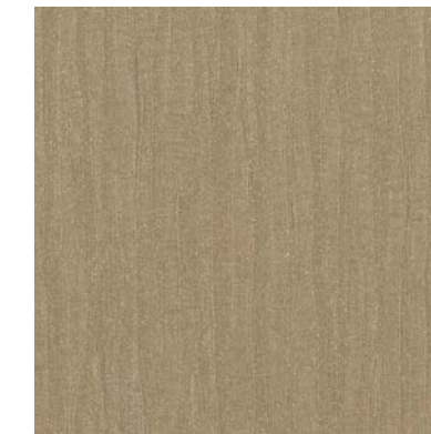
Click for CD2-GAZ-14