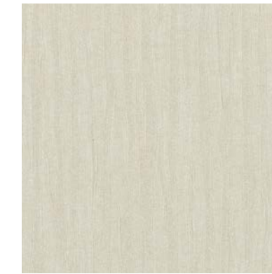
Click for CD2-GAZ-11