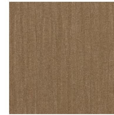
Click for CD2-GAZ-15