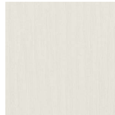
Click for CD2-GAZ-08