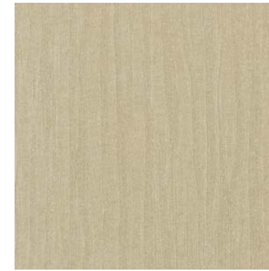
Click for CD2-GAZ-13